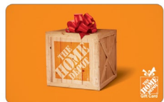
The Home Depot® Gift Card Starting at 4,500 points