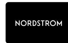
Nordstrom Gift Card Starting at 7,000 points