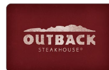
Outback Steakhouse® Gift Card Starting at 4,500 points