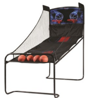
Escalade Atomic Double Shot Basketball Game 31,000 points