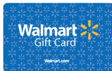
Walmart Gift Card Starting at 4,500 points