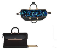
Ted Baker Luggage Albany Large Trolley Duffle 57,000 points