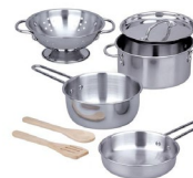
Melissa & Doug® Let's Play House!™ Stainless Steel Pots & Pans Play Set 7,000 points