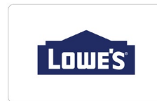
Lowe's® Gift Card Let's Build Something Together Starting at 4,500 points