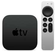
Apple TV® 4K Starting at 29,000