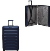
Bric's Porsche Design® Roadster 32-Inch Expandable Spinner 95,000 points