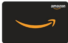
Amazon.com Gift Card Starting at 4,500 points