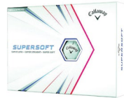
Callaway Supersoft 21 Golf Balls - One Dozen 6,000 points