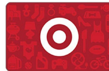
Target GiftCard Starting at 4,000 points