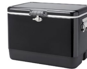
Coleman® 54-Quart Steel Cooler 9,000 points