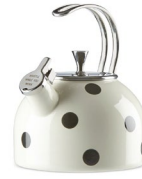
kate spade new york All in Good Taste Scatter Dot Tea Kettle 9,000 points