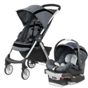
Chicco® Mini Bravo® Sport Travel System 41,000 points