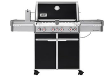
Weber Summit E-470 Gas Grill (Liquid Propane) 339,000 points