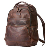
Frye Men's Logan backpack 60,000 points