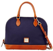
Dooney & Bourke Pebble Grain Zip Zip Satchel 38,000 points