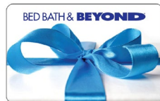
BED BATH & BEYOND® Gift Card Starting at 4,500 points