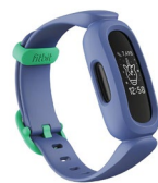
Fitbit® Kids Ace 3™ Activity Tracker 13,000 points