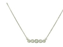
Antwerp Diamonds "Bezel Straight Bar" Necklace 146,000 points