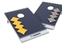
Triumph Sports All-Pro All Weather Bag Toss 24,000 points