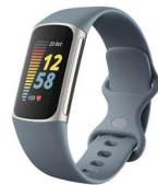
Fitbit® Charge 5™ Advanced Fitness + Health Tracker 25,000 points