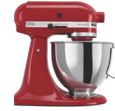
KitchenAid® Artisan Series Stand Mixer 71,000 points