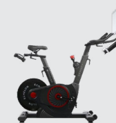
Echelon Connect EX5S Bike 266,000 points