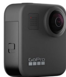
GoPro MAX 360 Degree Action Camera 75,000 points