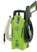
Earthwise™ 1650 PSI Electric Pressure Washer 22,000 points