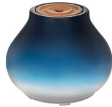
Ellia Essential Oils Imagine Cordless Ultrasonic Aroma Diffuser 9,000 points