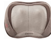
HoMedics® 3D Shiatsu and Vibration Massage Pillow with Heat 9,000 points